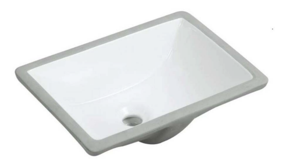
Dimensions Outer: 17-15/16" x 12-13/16" x 7-1/2" Inner: 15-3/4" x 10-13/16"