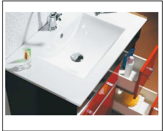
Installed Product Image